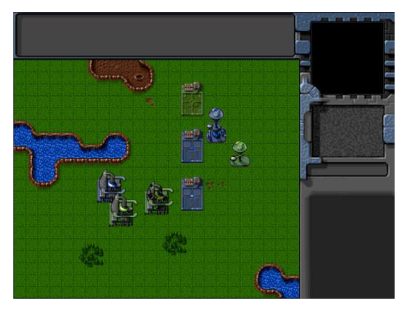
Figure 6-5. The two harvester buildings

When we open the game in the browser and start the level, we should see two new harvester buildings, as shown in Figure 6-5.