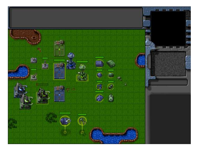
Figure 6-13. Selected items show up highlighted

Notice that the life bar above the damaged building clearly shows us how badly damaged it is. You can add or subtract items from the selection by clicking them with the Shift key pressed. We have now completely implemented entity selection in our game.