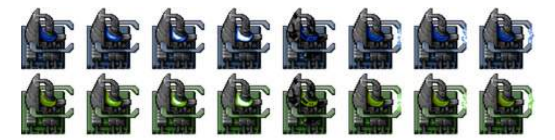
Figure 6-1. Sprite sheet for the base

The base will consist of a single sprite sheet image that contains different animation states for the base (see Figure 6-1).