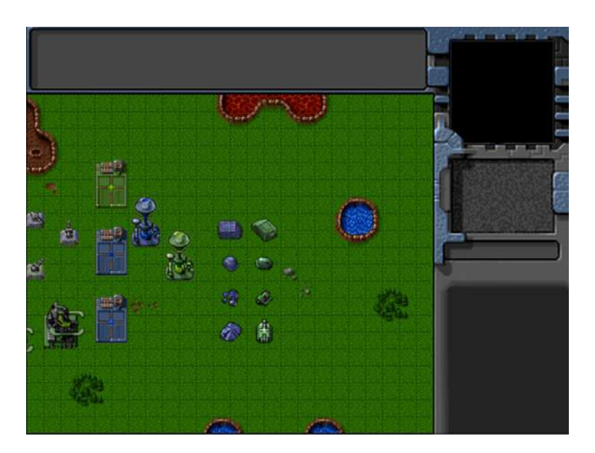
Figure 6-9. Adding vehicles to the level

When we open the game in the browser and start the level, we should see the vehicles, as shown in Figure 6-9.