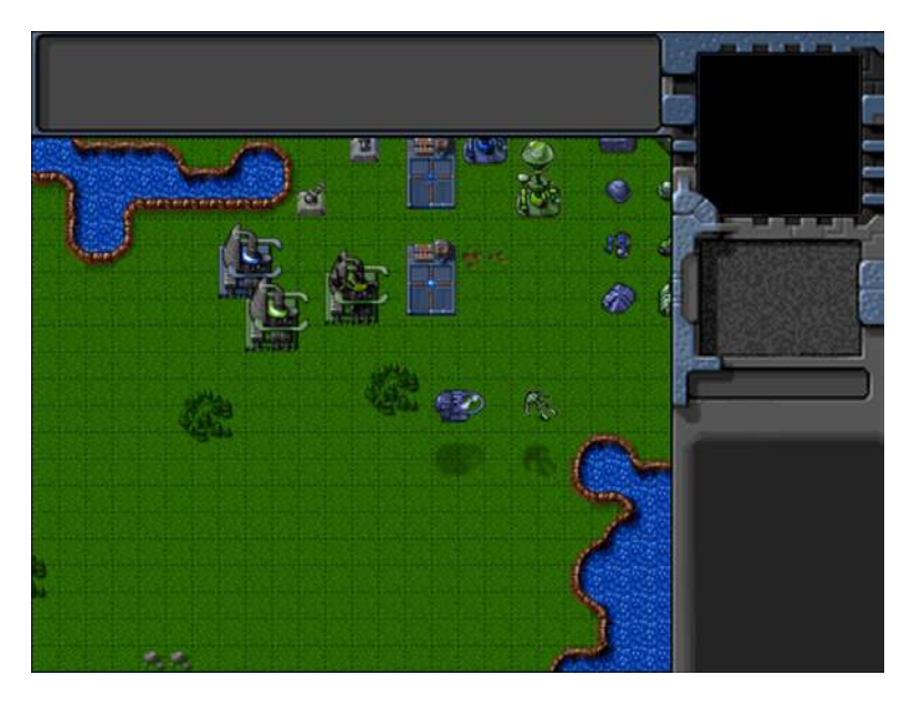
Figure 6-11. The aircraft floating above the ground

When we open the game in the browser and start the level, we should see the aircraft hovering above the ground, as shown in Figure 6-11.