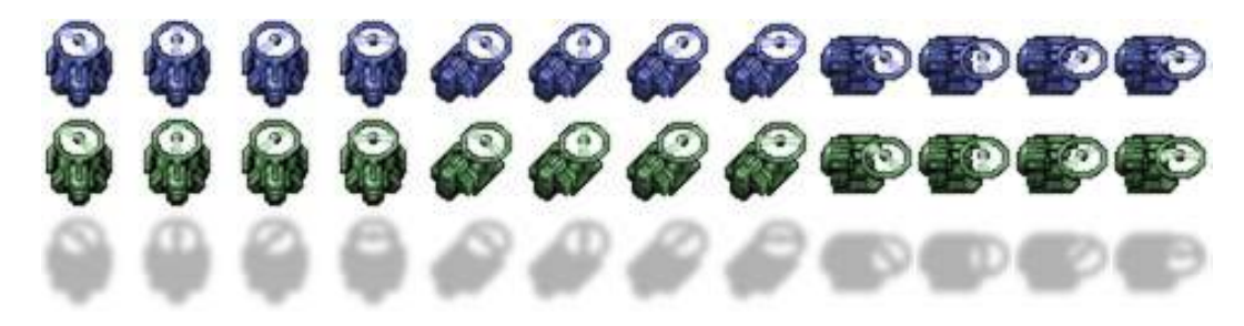
Figure 6-10. The chopper sprite sheet with shadows

The aircraft in our game have a sprite sheet similar to vehicles except for one difference: shadows. The aircraft sprite sheet has a third row with shadows in it. Also, the chopper sprite sheet has multiple images for each direction, as shown in Figure 6-10.