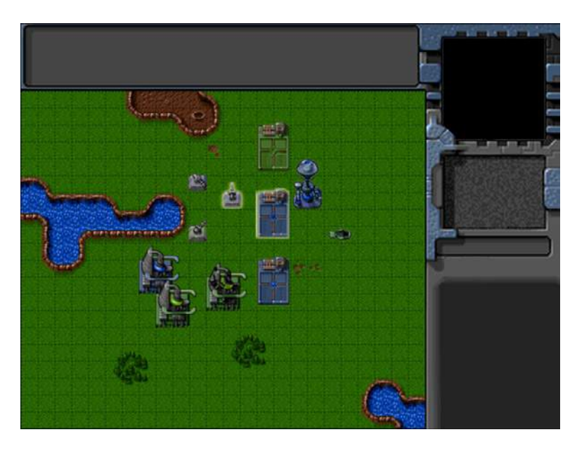
Figure 6-7. The three ground turret buildings

We specify a starting direction property for the first two turrets and set the action property to teleport for the third. When we open the game in the browser and start the level, we should see three new turrets, as shown in Figure 6-7.