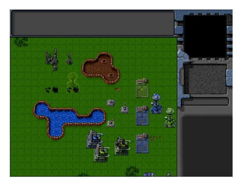
Figure 6-12. Adding the rocks and the oil fields

The oil field on the right with the hint has a subtle glowing image of a harvester to let the player know that a harvester can be deployed there. This hint version of the oil field can be used in the earlier levels of our campaign when the player has just been introduced to the idea of harvesting.