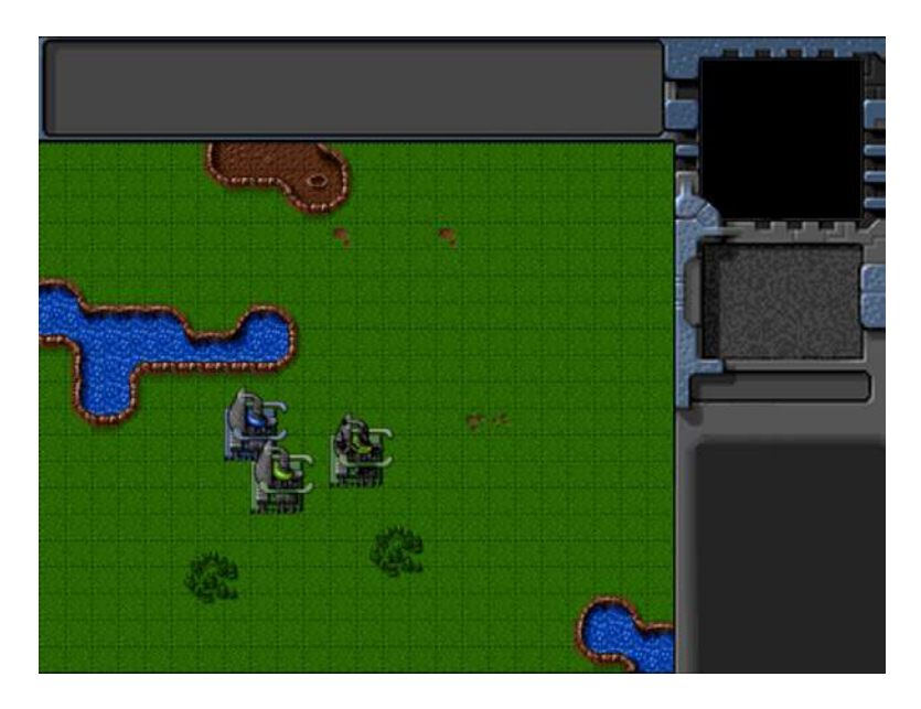
Figure 6-2. The three base buildings

With this last change, we are now ready to see our first game entity drawn on the screen. If we open the game in the browser and load the first level, we should see the three base buildings we defined in the map drawn next to each other (see Figure 6-2).