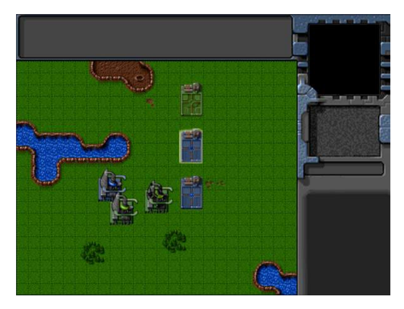
Figure 6-3. The three starport buildings

The first green team starport opens and then closes. The second blue team starport first glows and comes into existence and then switches to stand mode, while the last blue team starport merely waits in stand mode. Now that the starport has been added, the next building we will look at is the harvester.